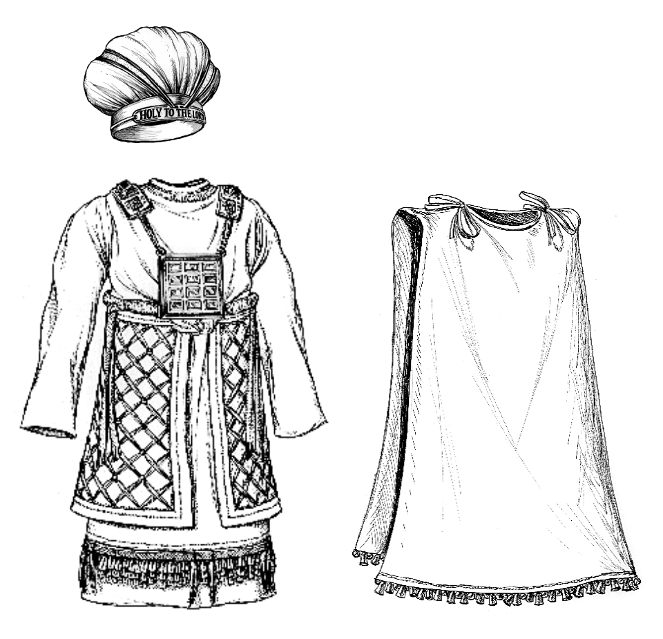
High Priests Garments